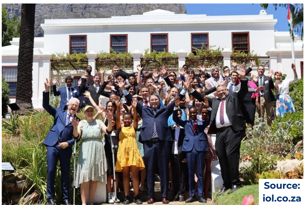
3E: The top 20 schools in the province with an NSC enrolment of 80 or more candidates (including independent schools) that have achieved excellence in academic results in 2023 are: